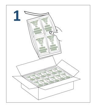
At the time of final packaging remove Dri Clay bags from the sealed polybag.