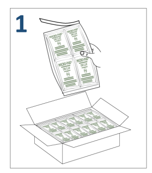
At the time of final packaging remove Dri Clay bags from the sealed polybag.