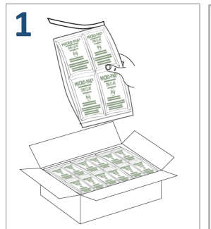
At the time of final packaging remove Dri Clay bags from the sealed polybag.