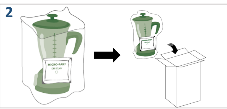
Place Dri Clay inside the polybag or box and seal it immediately. Pack item into master carton.