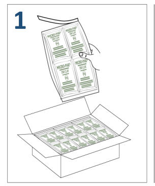
At the time of final packaging remove Dri Clay bags from the sealed polybag.