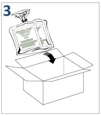
Store unused Dri Clay bags in the original polybag and seal it with tape. Store carton in a dry, cool