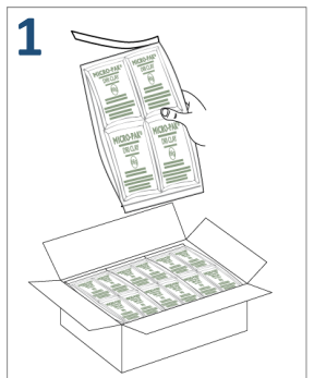
At the time of final packaging remove Dri Clay bags from the sealed polybag.